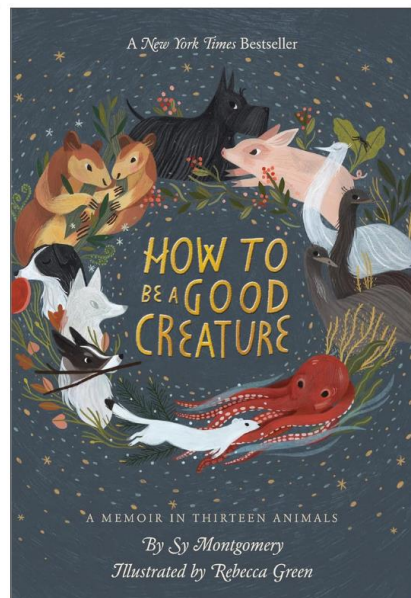
Join friends and neighbors for a book discussion!